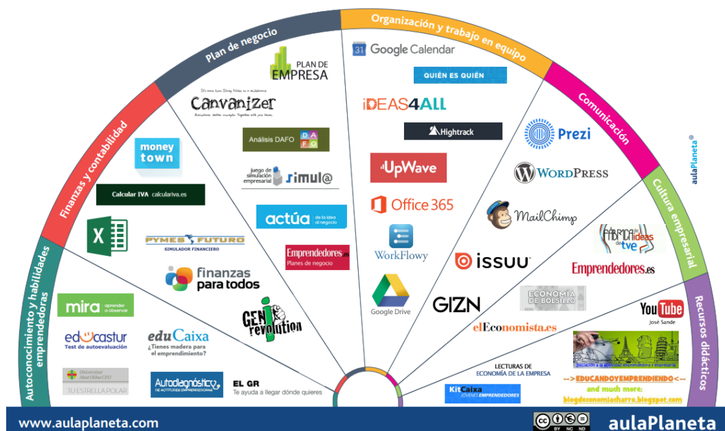
Figure 1. 40 tools to explore entrepreneurship in classrooms.

The teacher and student should select the most suitable to achieve the learning objectives proposed. For example, the next infographic summarises some specific digital educational resources that can be applied to foster entrepreneurship.